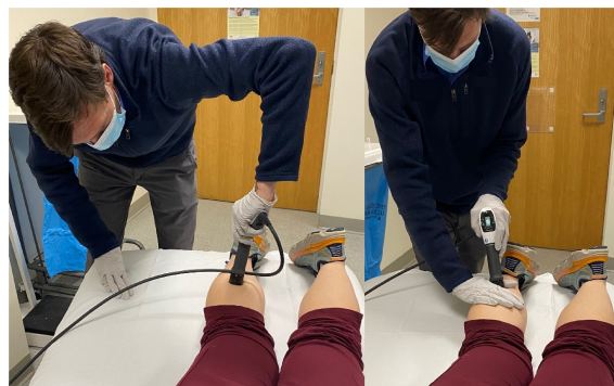
FIGURE 1 Left photograph with poor ergonomic positioning. Right photograph with proper ergonomic positioning

Delivery of shockwave can incorporate the use of technicians who serve as valued members of the treatment team and require proper training to administer treatment. Initial education should include shadowing and observing patient visits, understanding the principles and correct settings in use of focused and radial shockwave devices, and practicing correct documentation and cleaning procedures. Proper technique must be used in order for the treatment to be fully effective, therefore applying light, moderate, or firm amount of pressure to the area of injury as instructed by the physician while also holding the devices in an ergonomically efficient manner. The technician should review the patient's previous note as guidance for their current visit and execute the same procedure as directed by the physician. Also, teaching appropriate bedside manner will help reduce patient anxiety and encourage patient-to-technician communication throughout the procedure. Frequently asked questions are helpful to learn and be able to address while staying within scope of practice (Table 7).